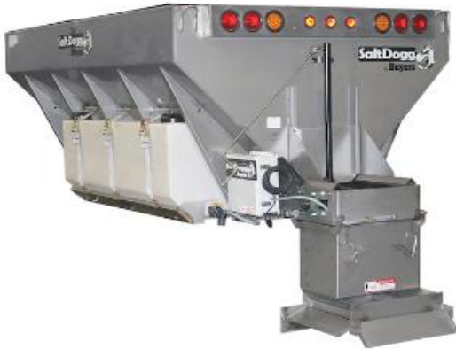
Hydraulic with chain

14509F572111: 6 cu yd, 9' 14509F575111: 6 cu yd, 9' 14509F576111: 6 cu yd, 9' 14510F572111: 7 cu yd, 10' 14510F575111: 7 cu yd, 10' 14510F576111: 7 cu yd, 10' 14510F632111: 8 cu yd, 10' 14510F635111: 8 cu yd, 10' 14510F636111: 8 cu yd, 10' 14512F572111: 8 cu yd, 12' 14512F575111: 8 cu yd, 12' 14512F576111: 8 cu yd, 12' 14510F692111: 9 cu yd, 10' 14510F695111: 9 cu yd, 10' 14510F696111: 9 cu yd, 10' 14512F632111: 10 cu yd, 12' 14512F635111: 10 cu yd, 12' 14512F636111: 10 cu yd, 12' 14514F572111: 10 cu yd, 14' 14514F575111: 10 cu yd, 14' 14514F576111: 10 cu yd, 14' 14512F692111: 11 cu yd, 12' 14512F695111: 11 cu yd, 12' 14512F696111: 11 cu yd, 12' 14514F632111: 11 cu yd, 14' 14514F635111: 11 cu yd, 14' 14514F636111: 11 cu yd, 14' 14514F692111: 13 cu yd, 14' 14514F695111: 13 cu yd, 14' 14514F696111: 13 cu yd, 14'